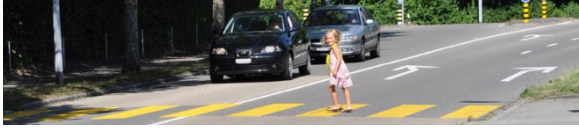
Swiss-quality markings & coatings

Basler Lacke AG Bresteneeggstrasse 17 5033 Buchs, Switzerland Phone +41 62 837 93 00 Fax +41 62 837 93 60 info@basler-lacke.ch www.basler-lacke.ch